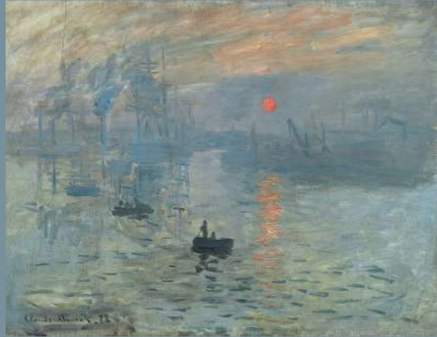
Above is Claude Monet's Impression, Sunrise.

Claude Monet was actually encouraged by his father to start painting, soon Monet studied art in Paris in 1859. Monet studied at the Swiss Academy. He gained his financial success in the late 1880s and 1890s. Claude Monet was an Impressionist painter. An Impressionist painter is someone who tends to use very small brushes and lines. They use light to help depict and change qualities in an art piece.