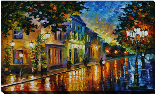
On the Way to Morning