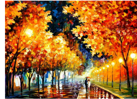
Golden Boulevard , by Leonid Afremov