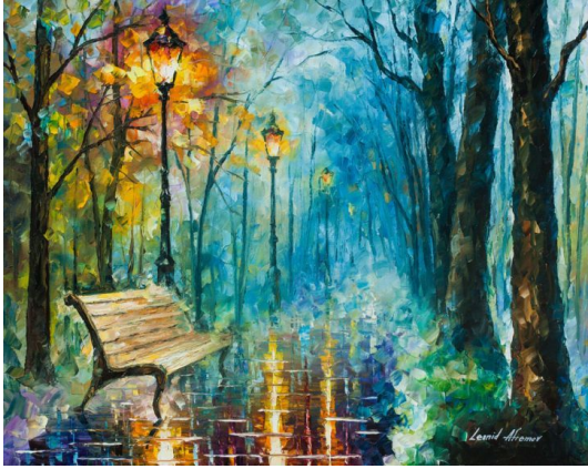
Night of Inspiration