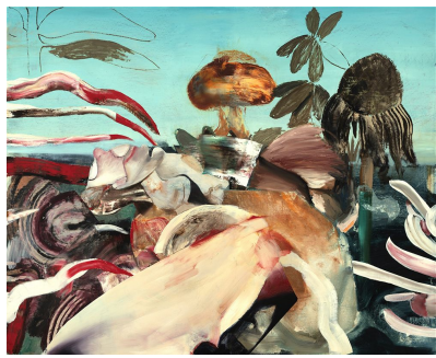
Jungles in Paris , by Adrian Ghenie