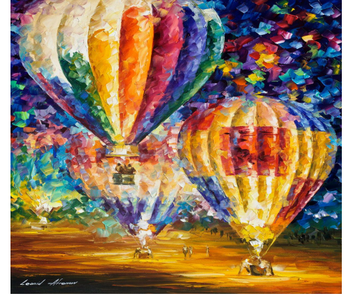
Balloon and Emotion