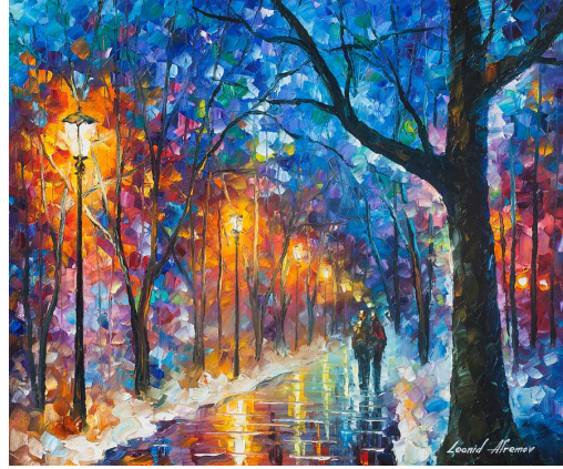
Warmed by Love