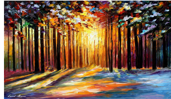
Morning Sun of January