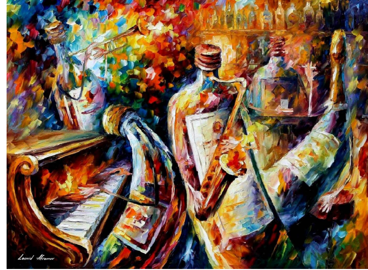
BOTTLE OF JAZZ