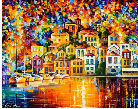
Dream Harbor , by Leonid Afremov