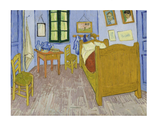
Bedroom in Arles