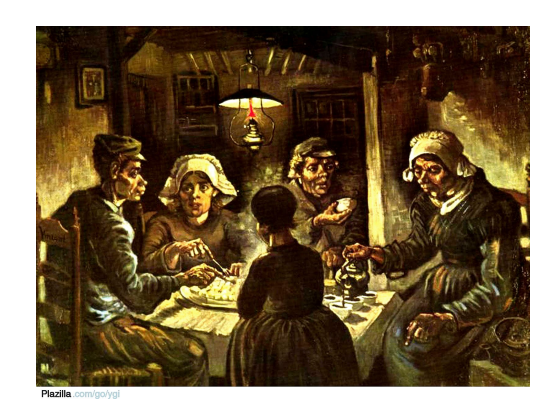
The Potato Eaters