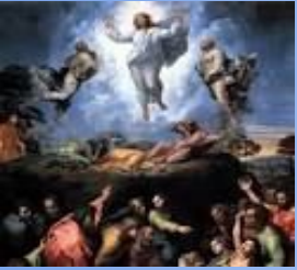
~"Transfiguration"(Raphael & Sebastiano del Piombo)