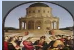
~"The Marriage of the Virgin"