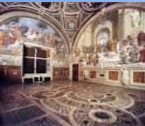
~"Stanza della Segnatura"(Raphael)