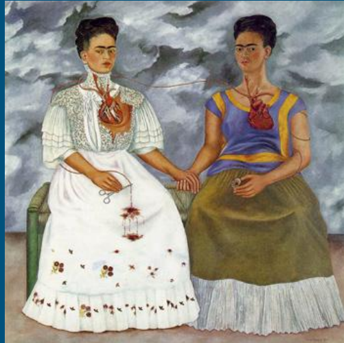
The Two Fridas, 1939