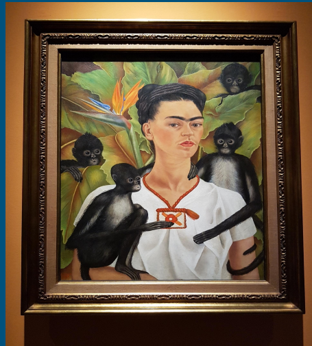
Self Portrait with Monkeys, 1943