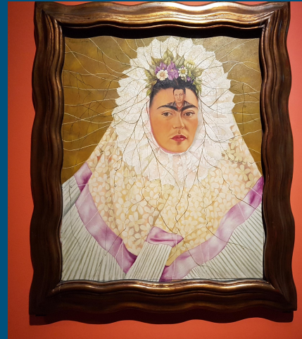
Self-Portrait as a Tehuana, 1943